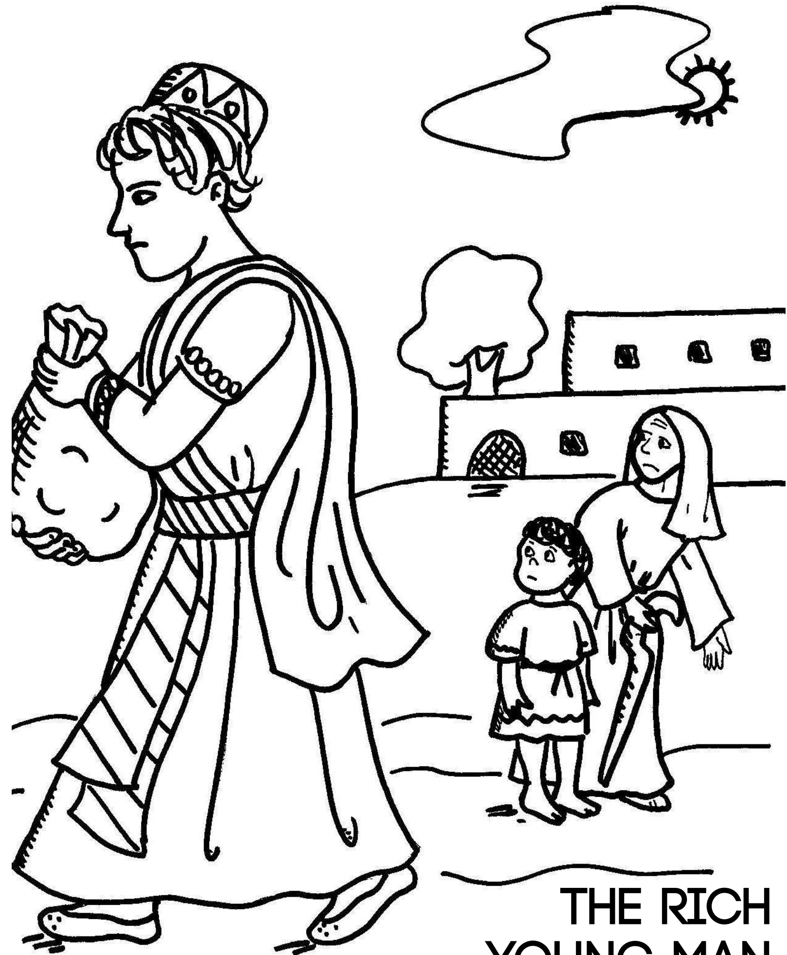
THE RICH YOUNG MAN