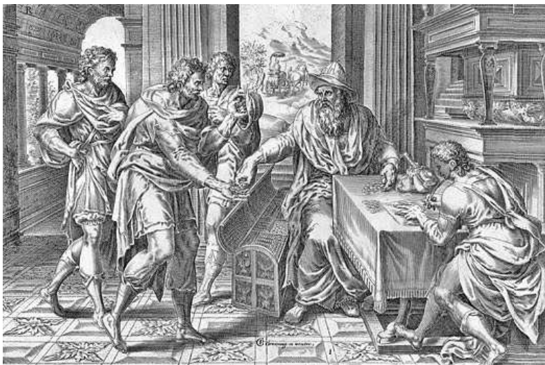
Engraving by Lucas van Doetechum