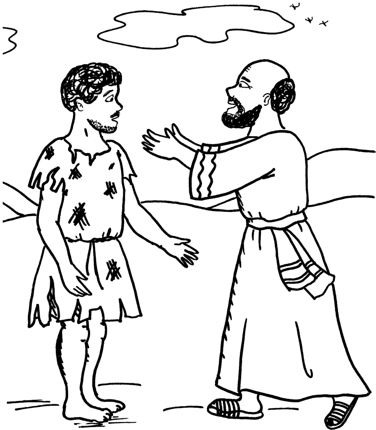
THE PARABLE OF THE LOSTS