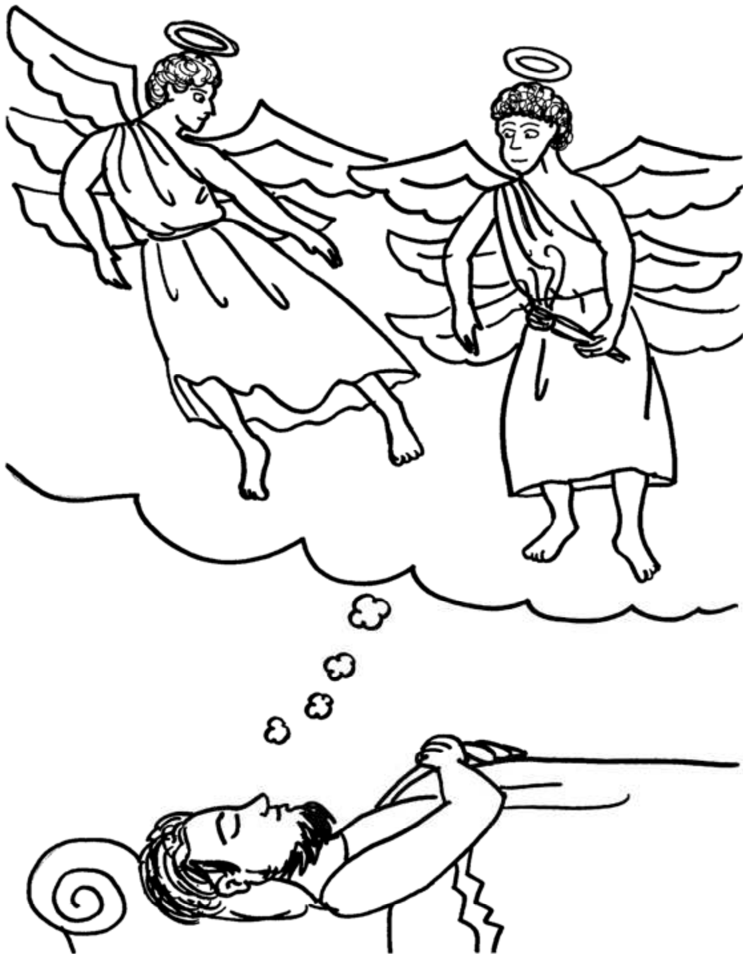
Story of Isaiah