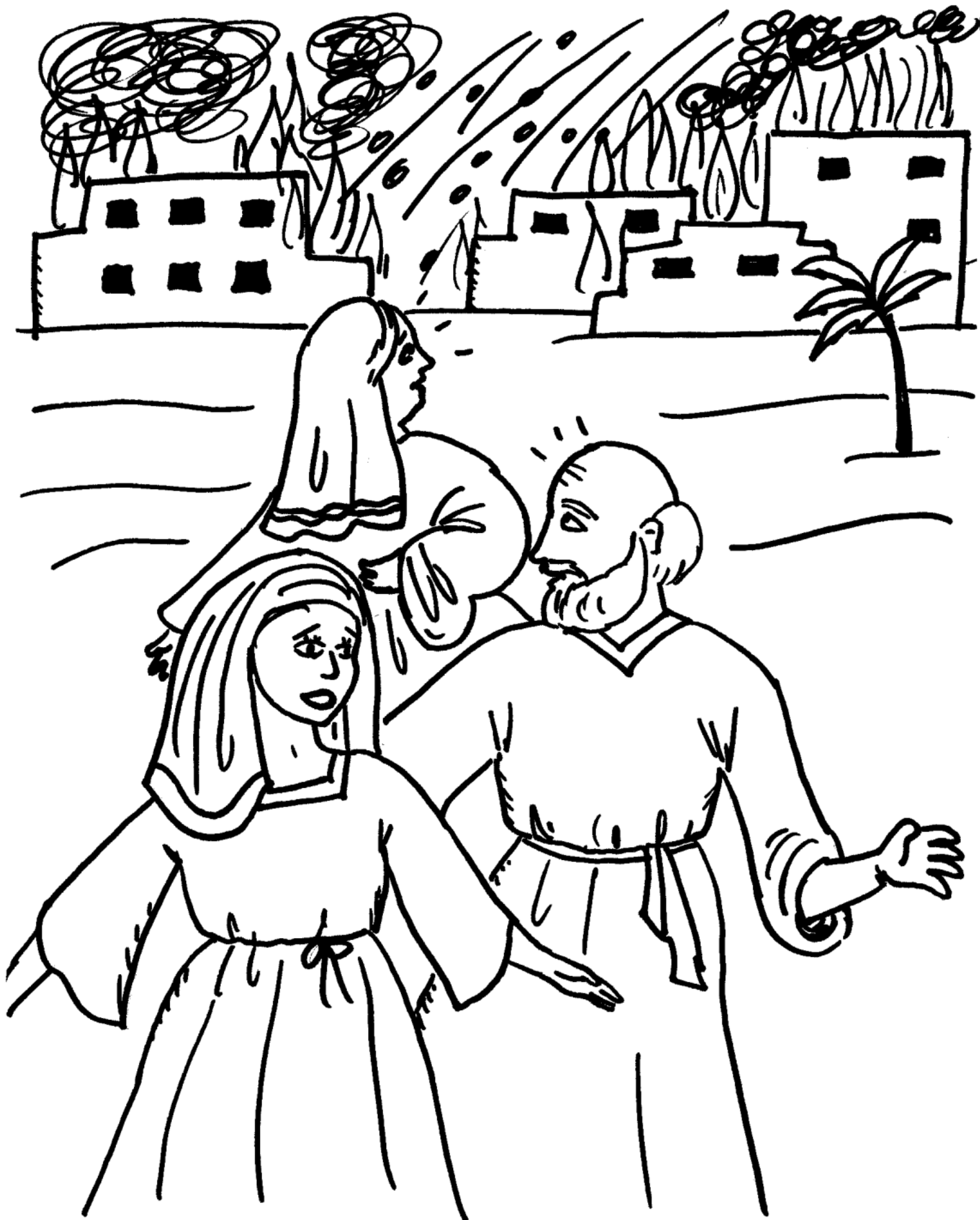
Sodom and Gomorrah