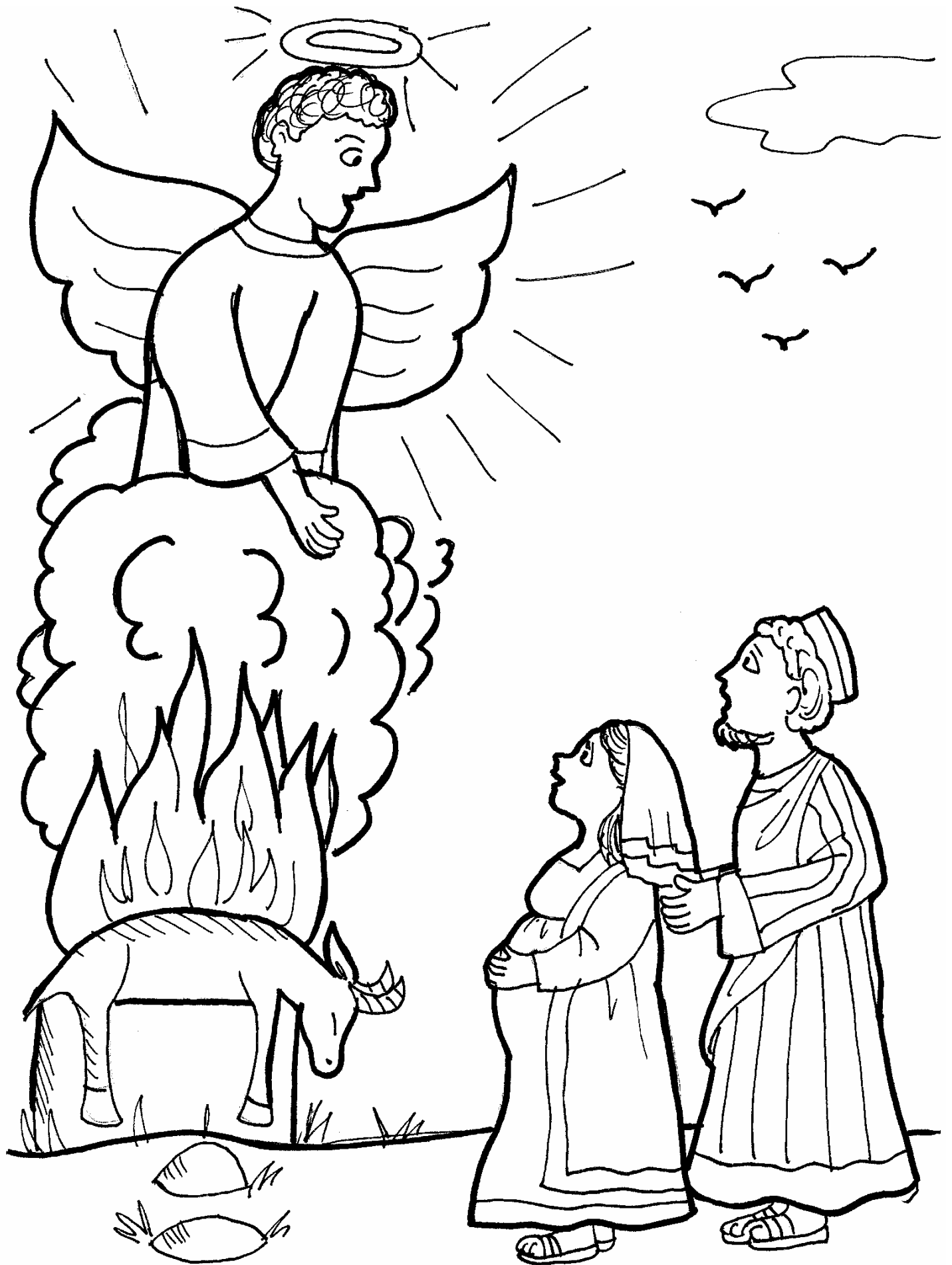
Samson's Birth & Marriage