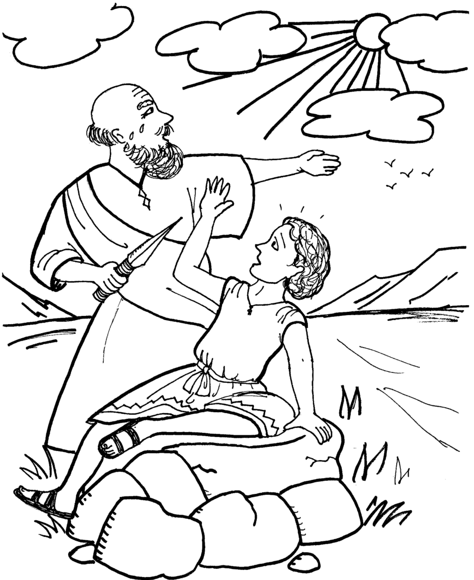
Sacrifice of Isaac