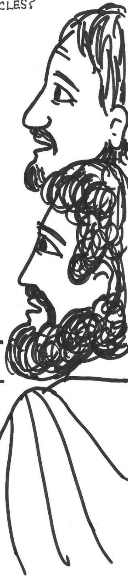
Peter and John Before the Sanhedrin