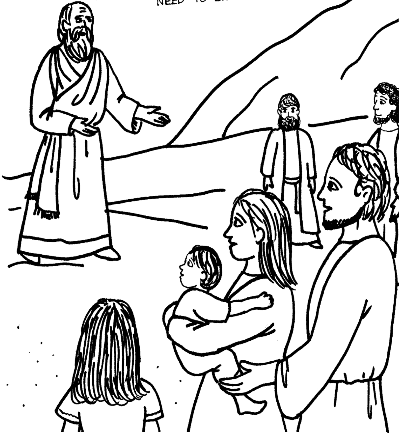
Mount Sinai : Tabernacle