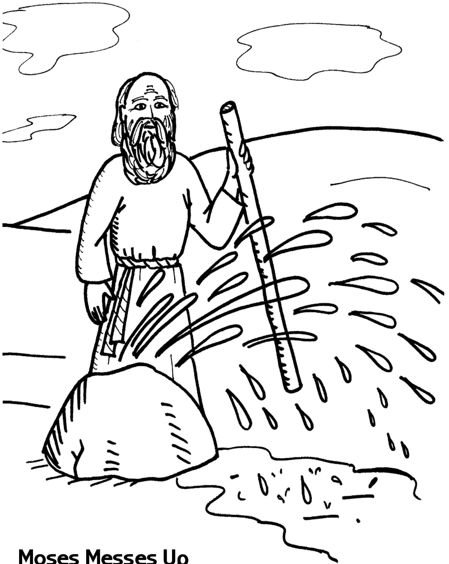
Moses Messes Up