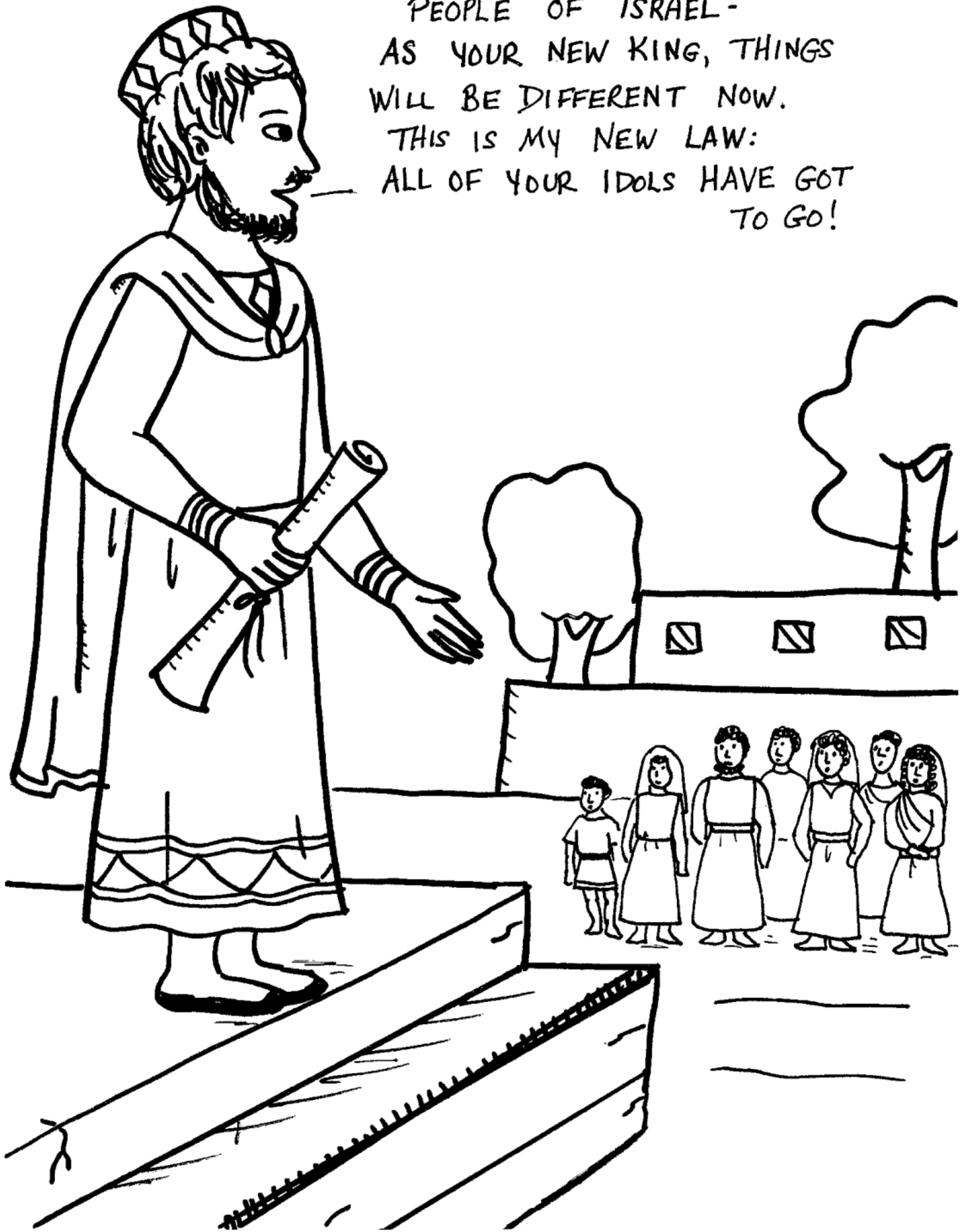
King Hezekiah of Judah

PEOPLE OF ISRAEL - AS YOUR NEW KING, THINGS WILL BE DIFFERENT NOW. THIS IS MY NEW LAW: ALL OF YOUR IDOLS HAVE GOT TO GO!