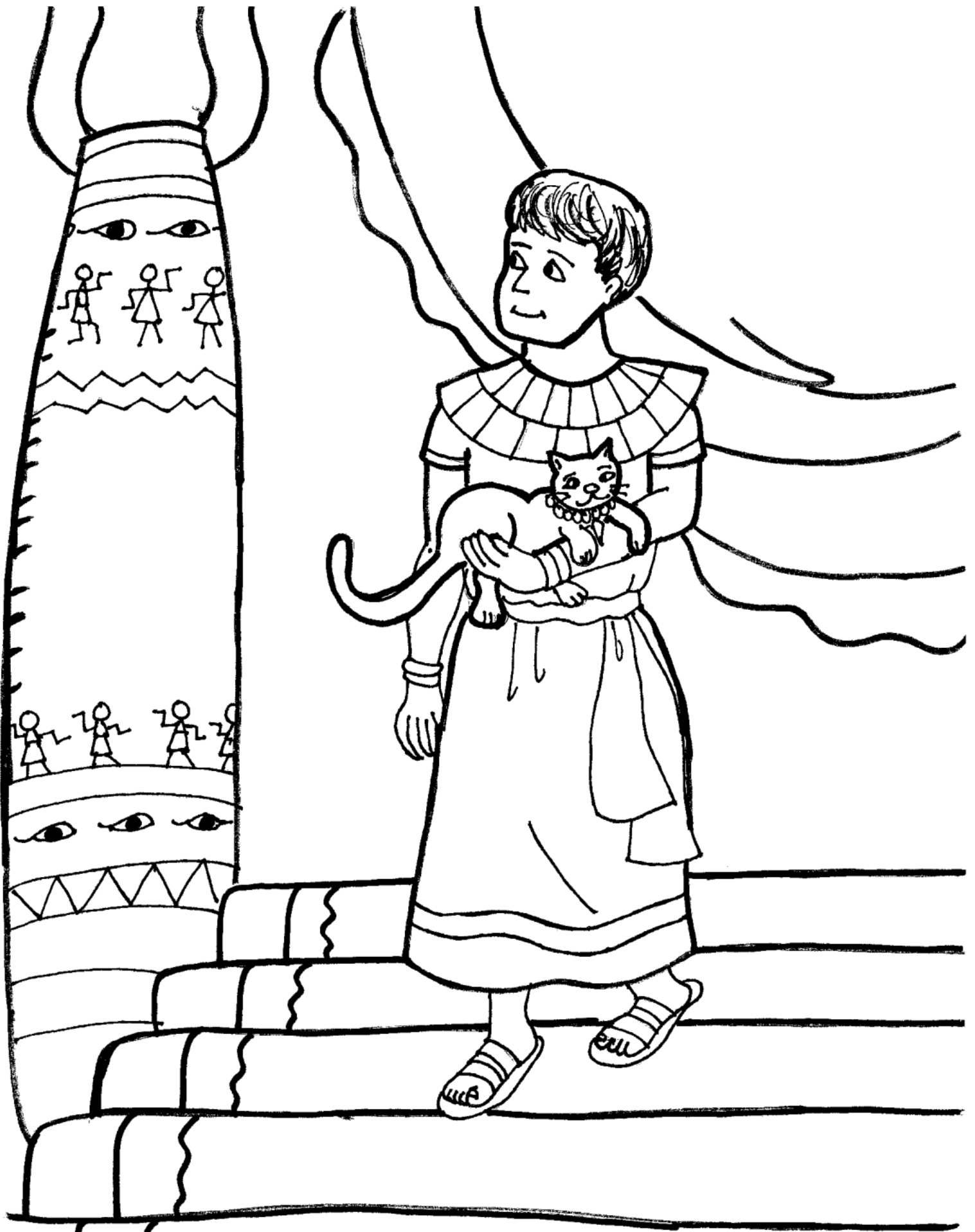
Joseph's Slavery @ Potiphar's House