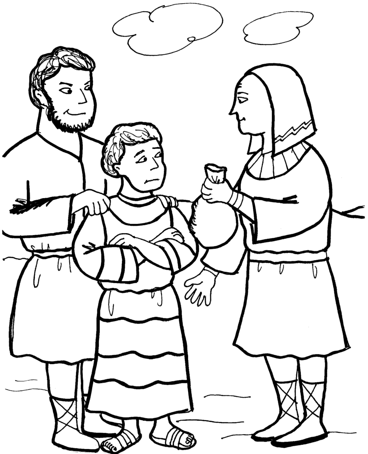
Joseph's Journey to Slavery