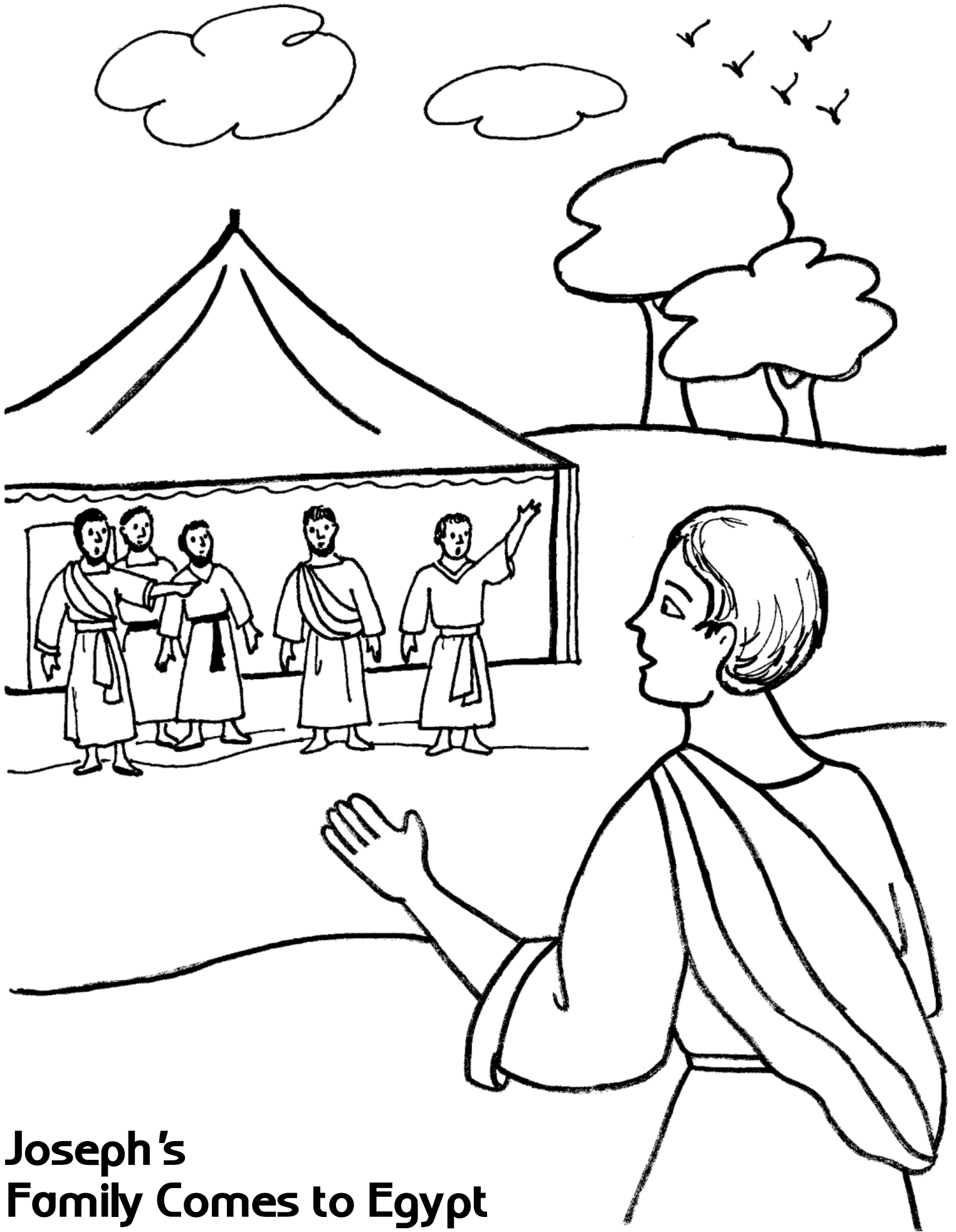
Joseph's Family Comes to Egypt