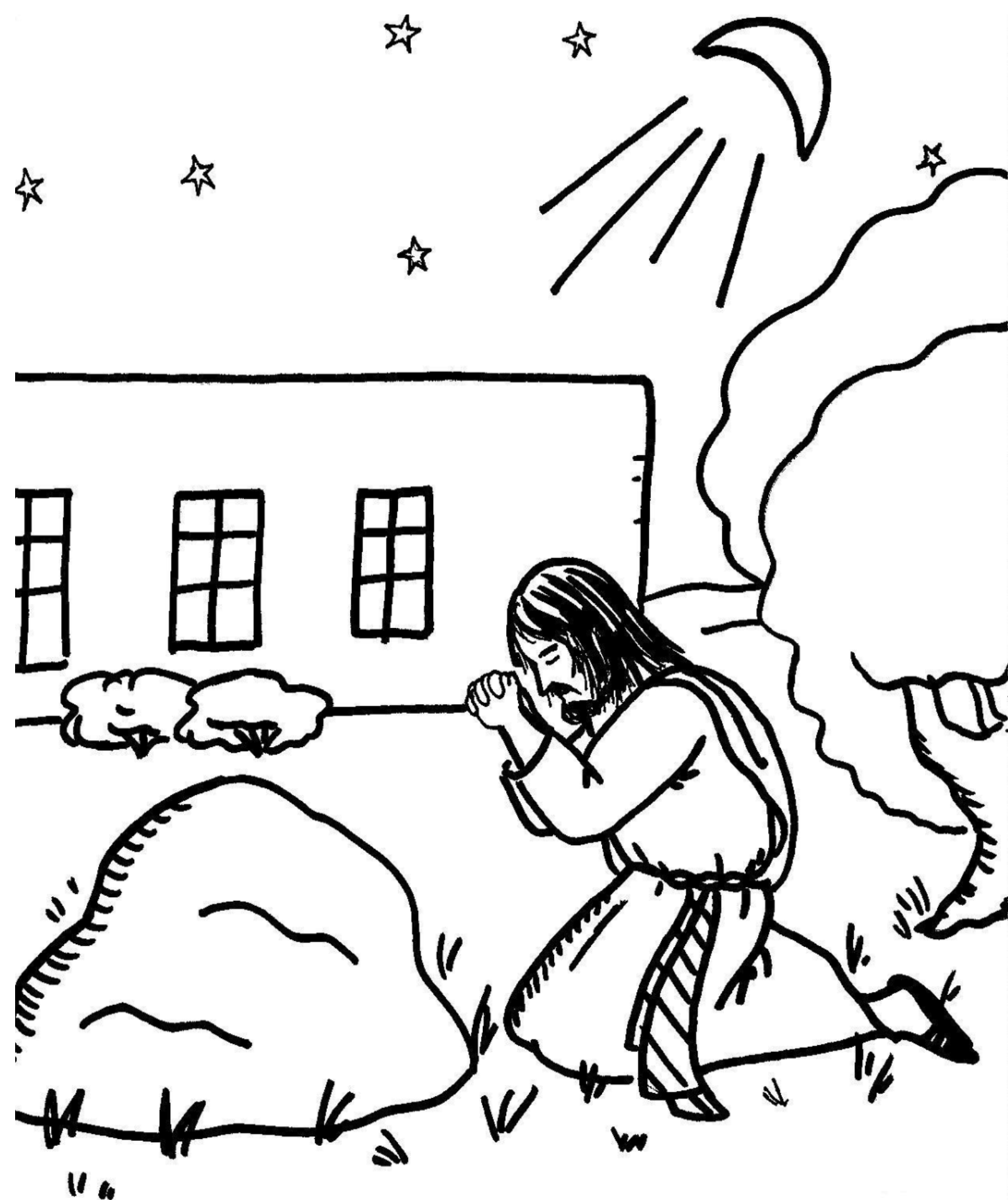
JESUS PRAYS IN GETHSEMANE