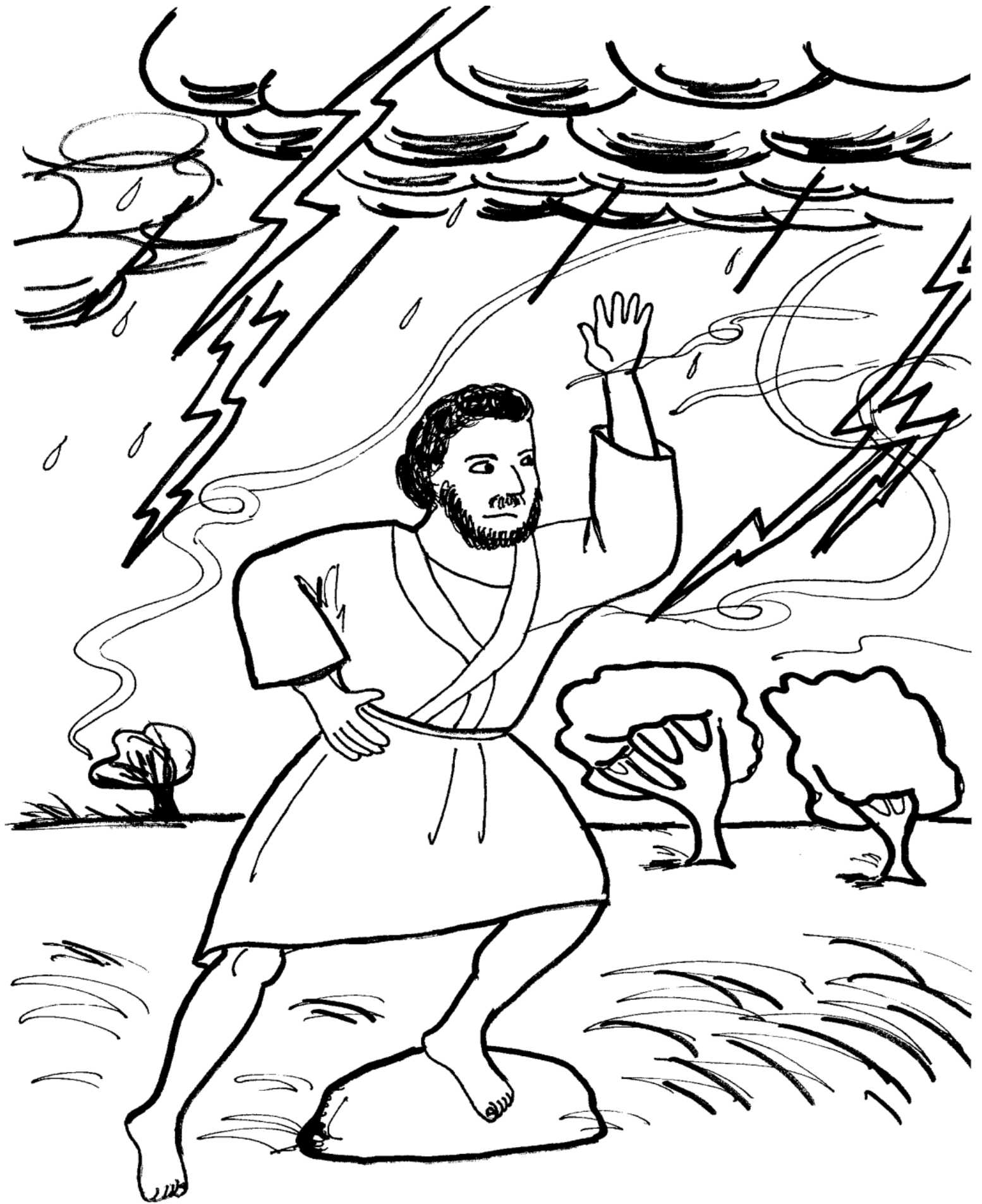
Jacob Goes Back to the Land & Wrestles