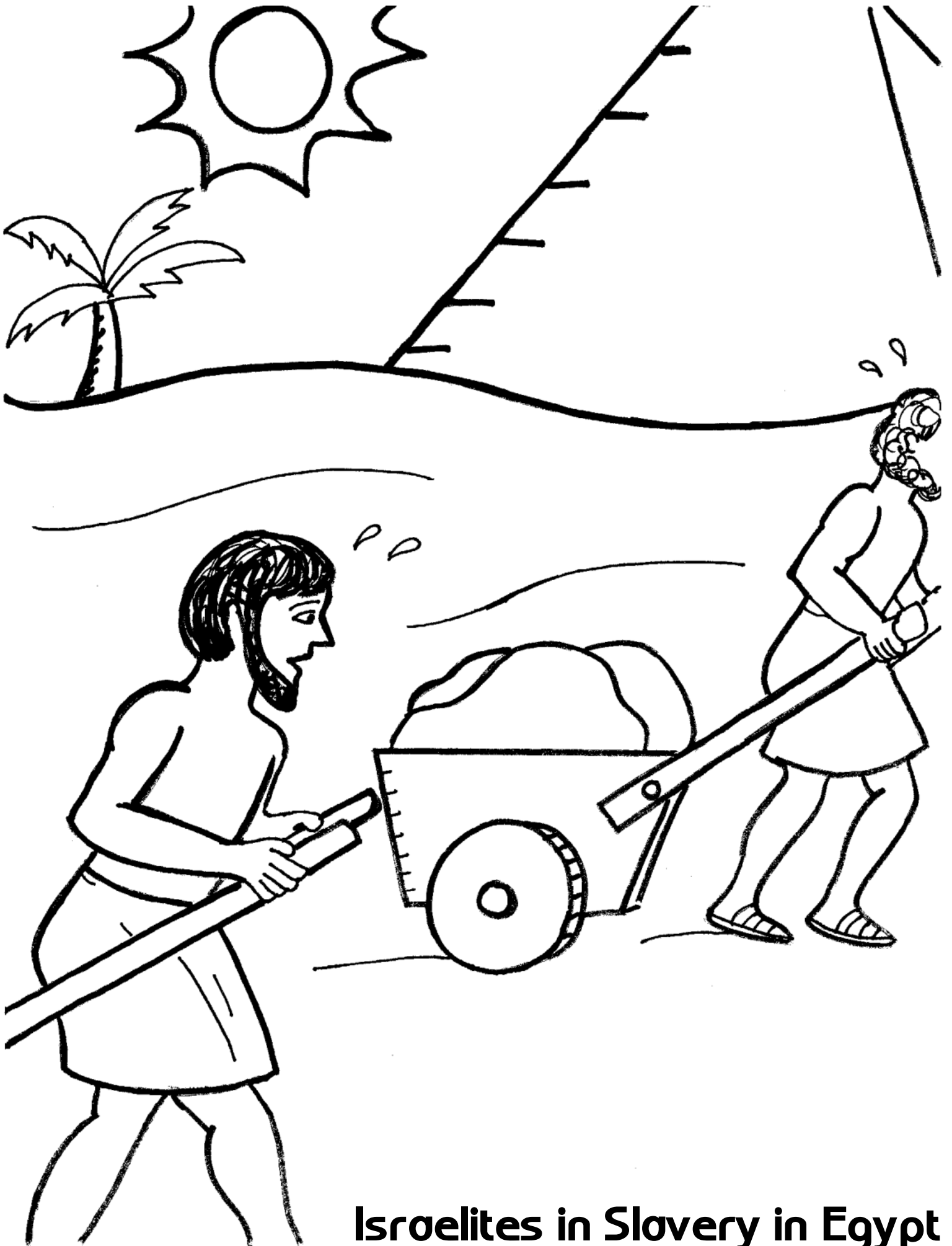
Israelites in Slavery in Egypt