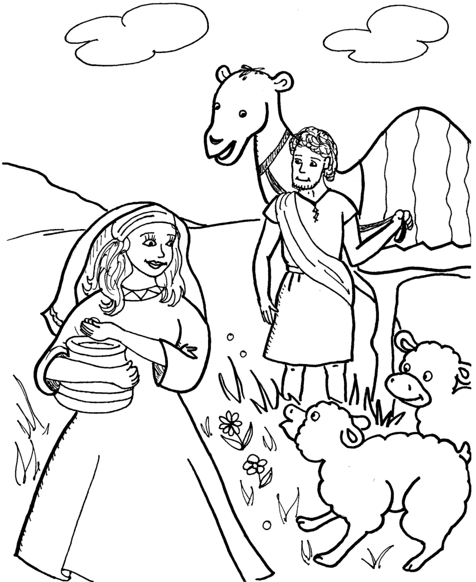
Isaac Marries Rebekah