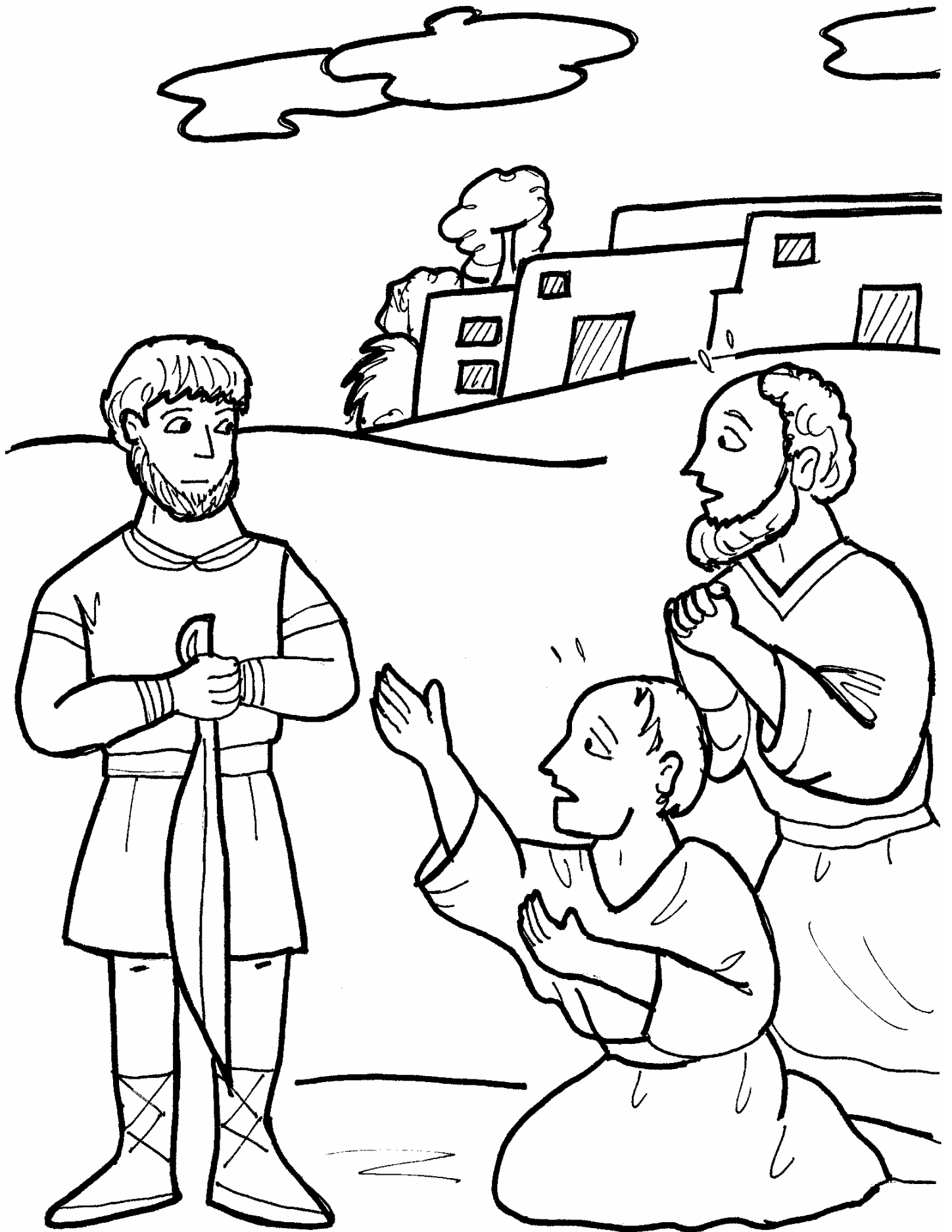
Gibeonite Deception & Rescue