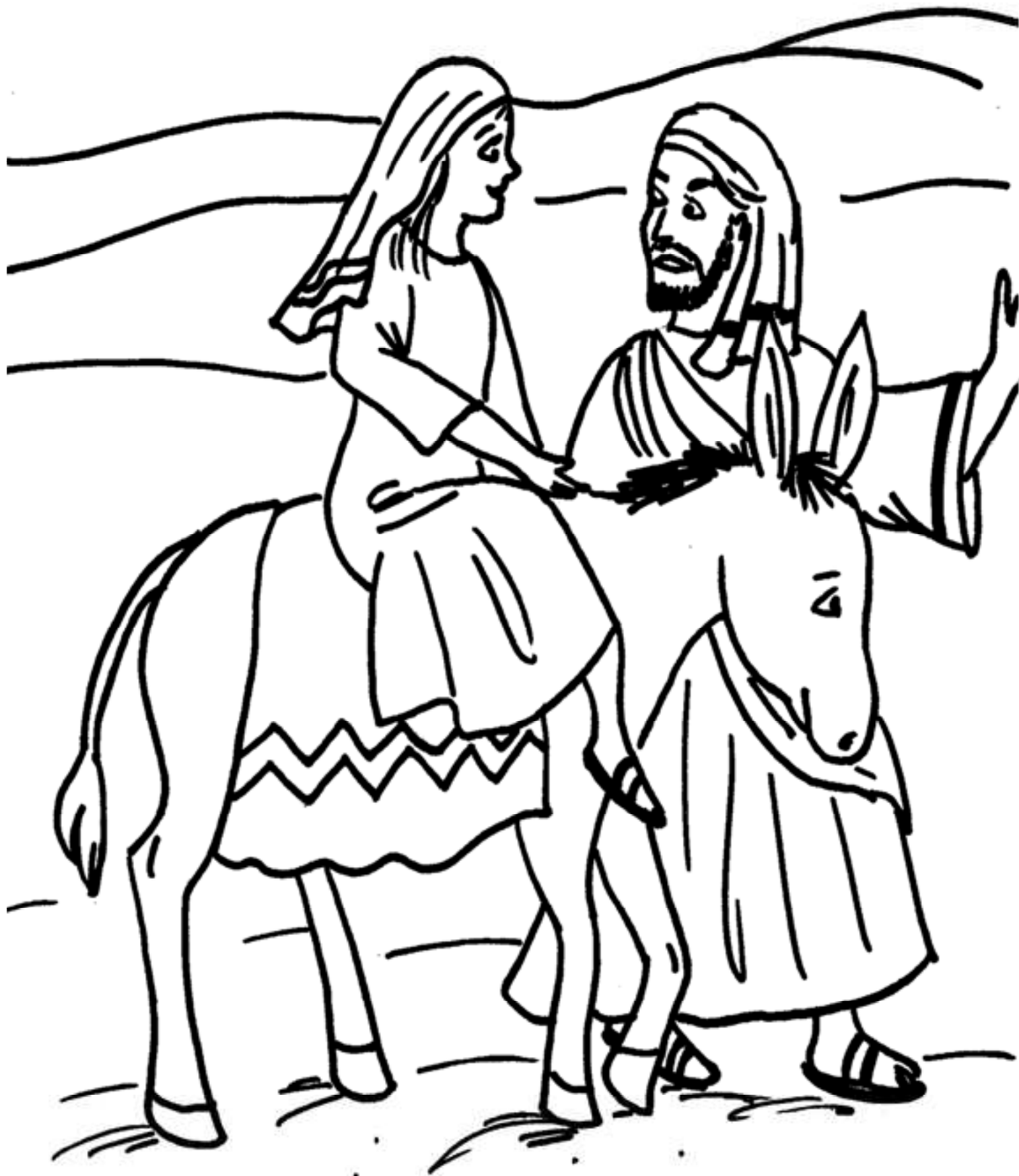
Call of Abraham