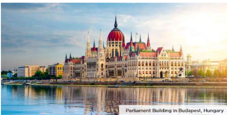
Parliament Building in Budapest, Hungary