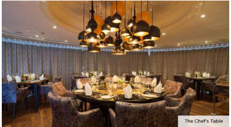
The Chef's Table