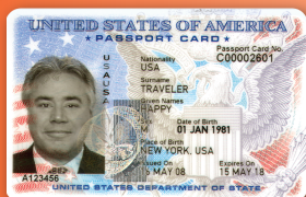
U.S. Passport Card