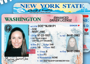
Enhanced Driver's License