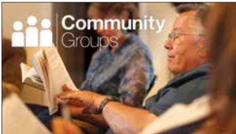
Groups gather in homes on scheduled Sunday evenings to build relationships together.