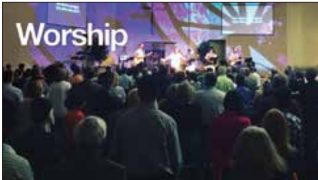
Our church family gathers for worship through Bible study and song at 9:00 or 10:30 AM.