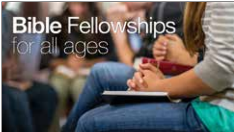
Children, students, and adults meet at 9:00 or 10:30 for small group study and conversations.