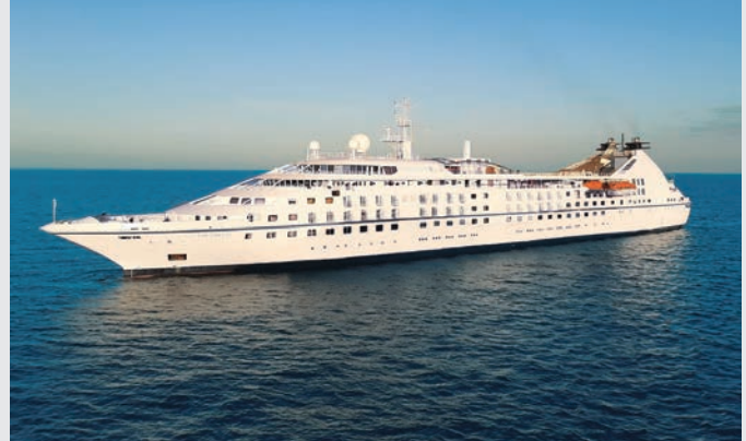
Star Breeze Deluxe Small Ship (Group Space)