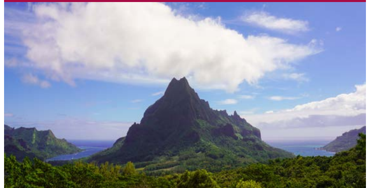
Mo'orea | 4 days, 3 nights Free time in Mo'orea | Included Ferry to Pape'ete