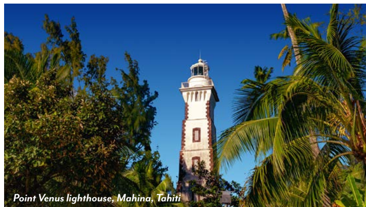
Point Venus lighthouse, Mahina, Tahiti