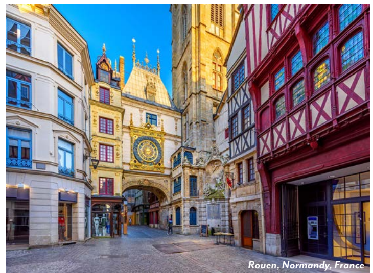
Rouen, Normandy, France

Gohagan & Company 8550 West Bryn Mawr Avenue, Suite 650 Chicago, Illinois 60631