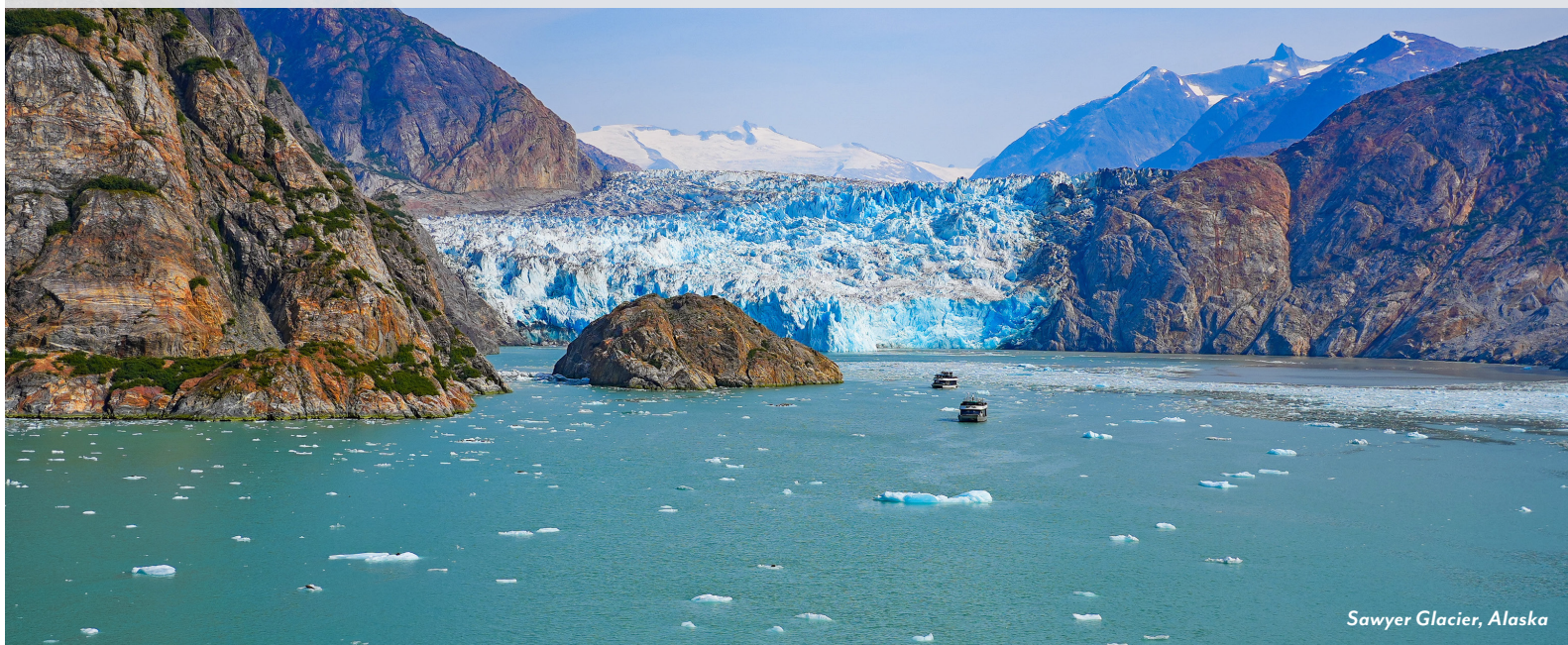
Sawyer Glacier, Alaska