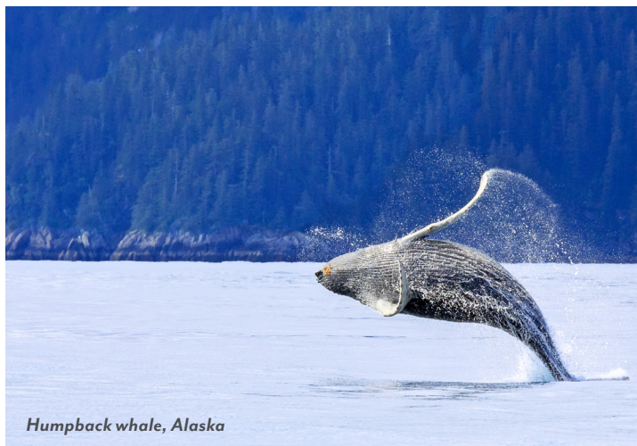
Humpback whale, Alaska