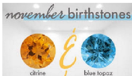
November Birthstones: Citrine & Blue Topaz

Your flower signifies happiness, companionship, health and friendship. You are noble in your thoughts and like to help others.