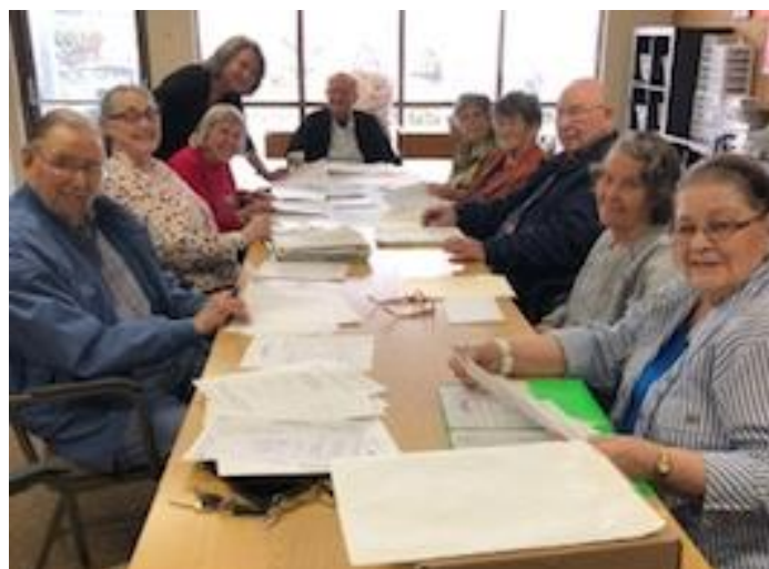
Thank you to all the wonderful volunteers on Gold Country's Welcoming Committee!