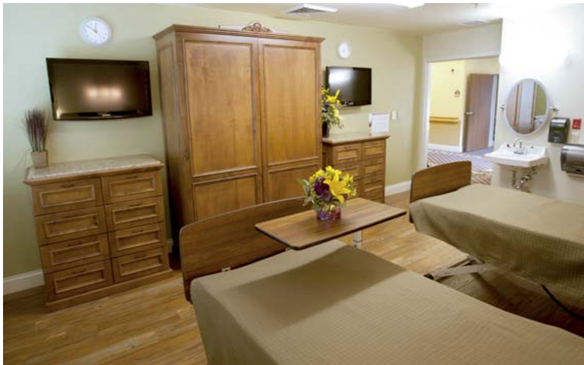
Spacious Private and Semi-Private Suites