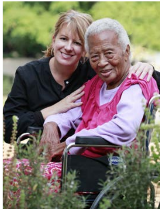
Compassionate Clinical Care