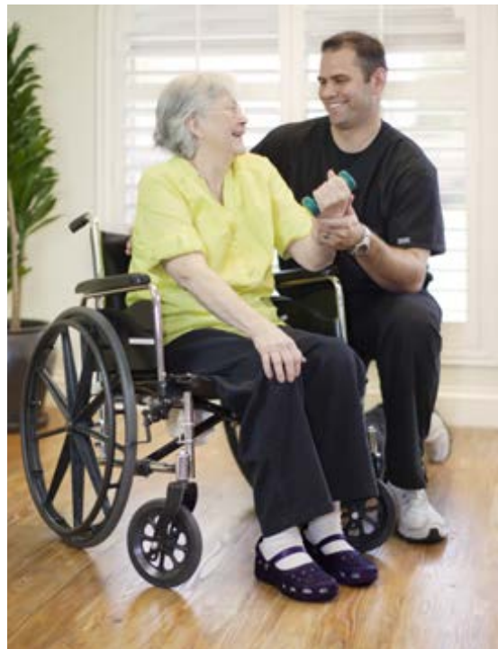
Innovative Therapy Gym