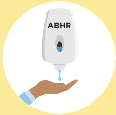
Perform Hand Hygiene