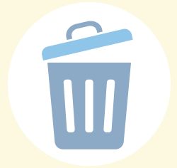
Dispose of Gown & Gloves in Room

Use EBP during high-contact care activities for residents with: