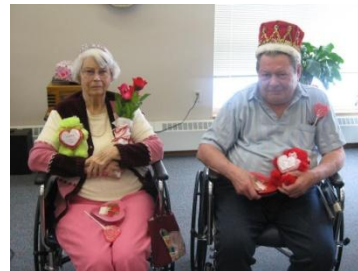
*Valentines Day King and Queen*

“Some people make the world more special just by being in it”