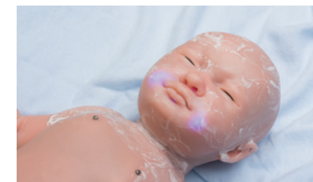
Cyanosis, jaundice, pink, and pallor