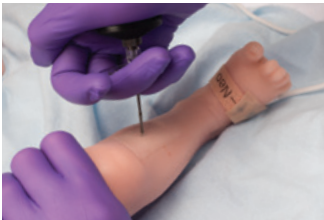
Hand and scalp IV, tibial IO