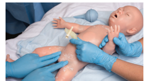
Pulses: fontanel, brachial, umbilical, and femoral