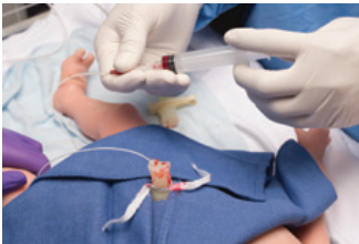
Continuous UAC/UVC infusion