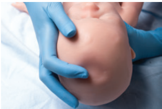
Sunken, bulging, and normal