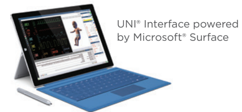
UNI® Interface powered by Microsoft® Surface