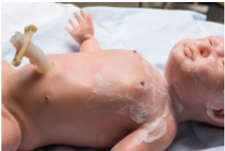
Programmable retractions, "see-saw" breathing