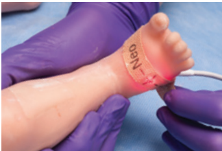
Pre- and post-ductal SpO2