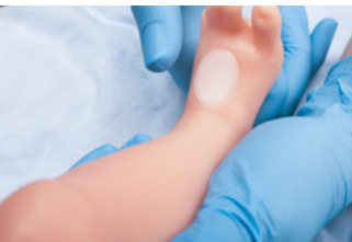
Capillary refill time testing