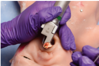
Anatomically accurate airway