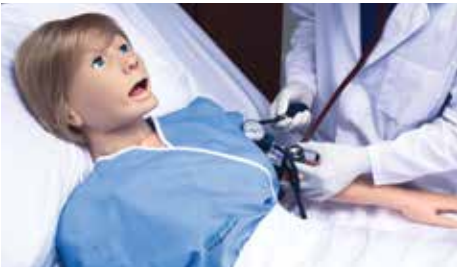
Blood pressure can be taken using BP cuff, palpation, or auscultation methods.