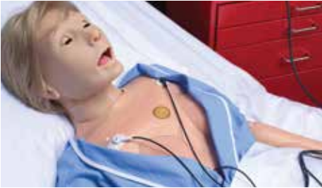
Attach real ECG electrodes and monitor rhythms in real-time. Capture, cardiovert, and pace using a real defibrillator and pads.