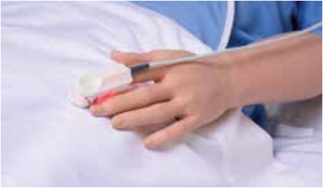
Control oxygen saturation in real-time while learners measure and monitor using a real pulse oximetry device.