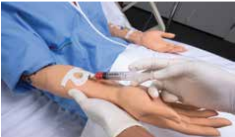
Blood pressure can be taken using BP cuff, palpation, or auscultation methods.