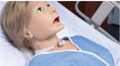
Practice tracheostomy care procedures including insertion, cleaning, and replacing cannulas safely.