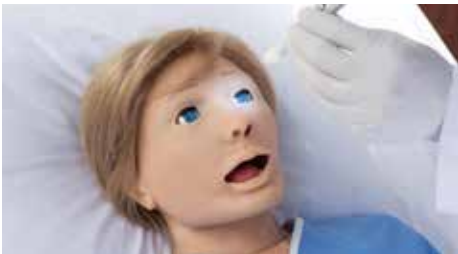
Speak as SUSIE and listen to provider’s responses via wireless streaming voice. Illustrate seizures, eye dilation, reactivity, and blink rate.

SUSIE’s physical and physiological features allow learners to train practical skills using real techniques, medical tools, and devices. Additionally, SUSIE’s breast and gynecological exam capabilities offer practice for learners in specialized nursing and medicine.