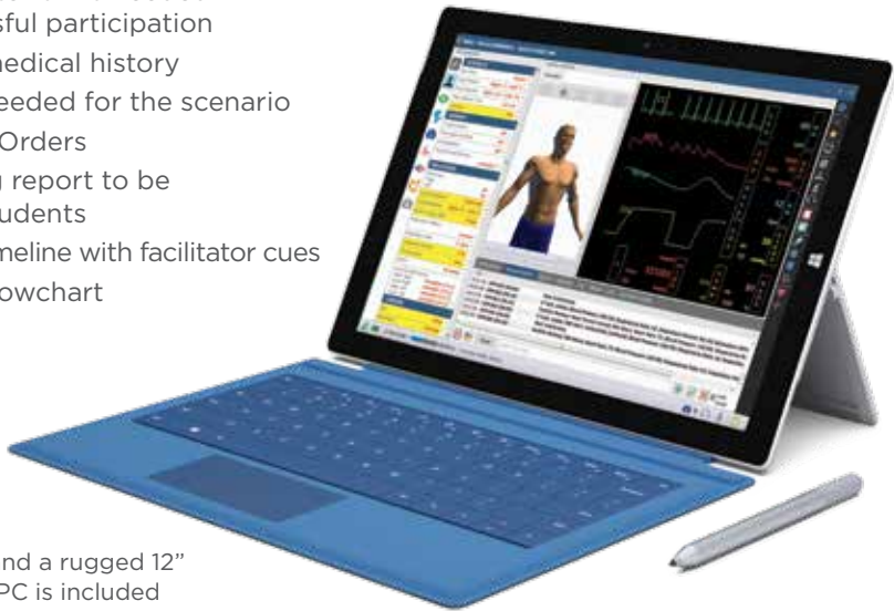
UNI® software and a rugged 12” wireless tablet PC is included

SUSIE’s physical and physiological features allow learners to train practical skills using real techniques, medical tools, and devices. Additionally, SUSIE’s breast and gynecological exam capabilities offer practice for learners in specialized nursing and medicine.