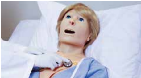
Normal and abnormal airway, heart, lung, and bowel sounds.