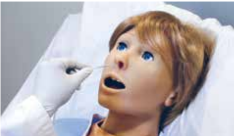
Supports oral or nasal intubation: ETT, LMA, King LT, NG. Enable difficult airway: tongue edema, pharyngeal swelling, and laryngospasm.