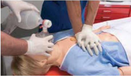
eCPR™ - Monitor CPR quality metrics in real-time including rate and compression depth, no-flow time, and ventilations.