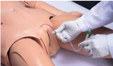
Interchangeable male/female genitalia allows catheterization. Rectum supports enemas and removing intestinal fluids introduced via NG tube.