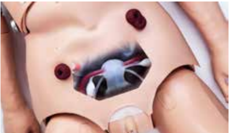
Interchangeable normal and abnormal uteri and cervixes simulate various pathologies and stages in pregnancy.