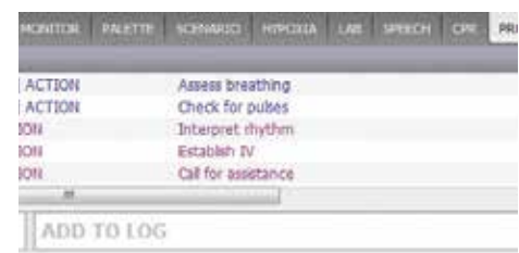
Track the actions of up to six care providers