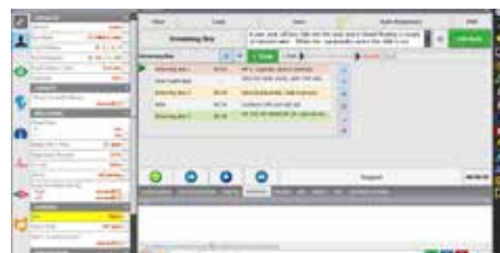
Scenarios link physiologic states