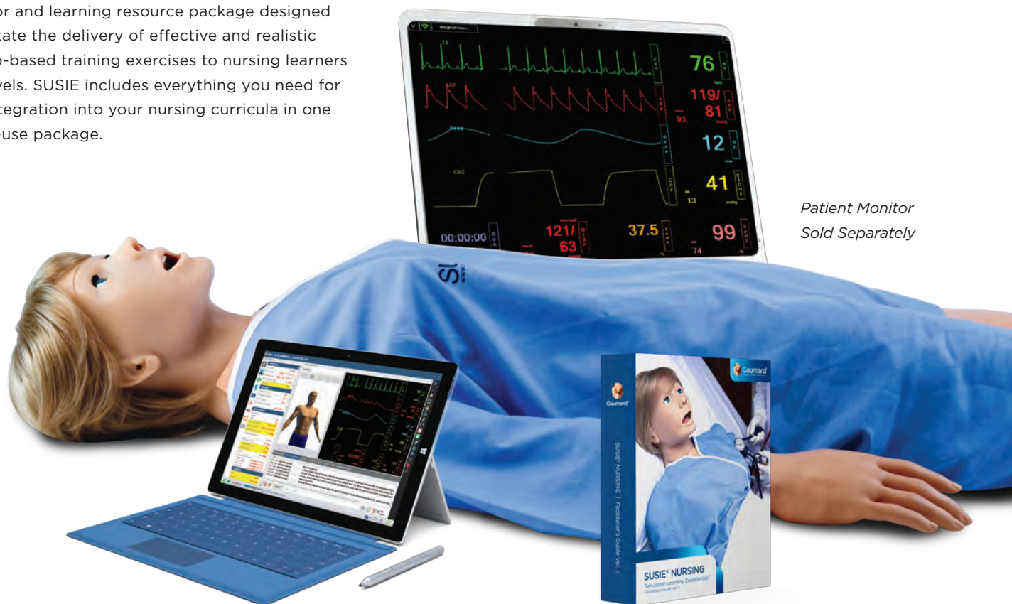
Patient Monitor Sold Separately

SUSIE is an advanced, wireless and tetherless patient simulator and learning resource package designed to facilitate the delivery of effective and realistic scenario-based training exercises to nursing learners of all levels. SUSIE includes everything you need for rapid integration into your nursing curricula in one easy-to-use package.