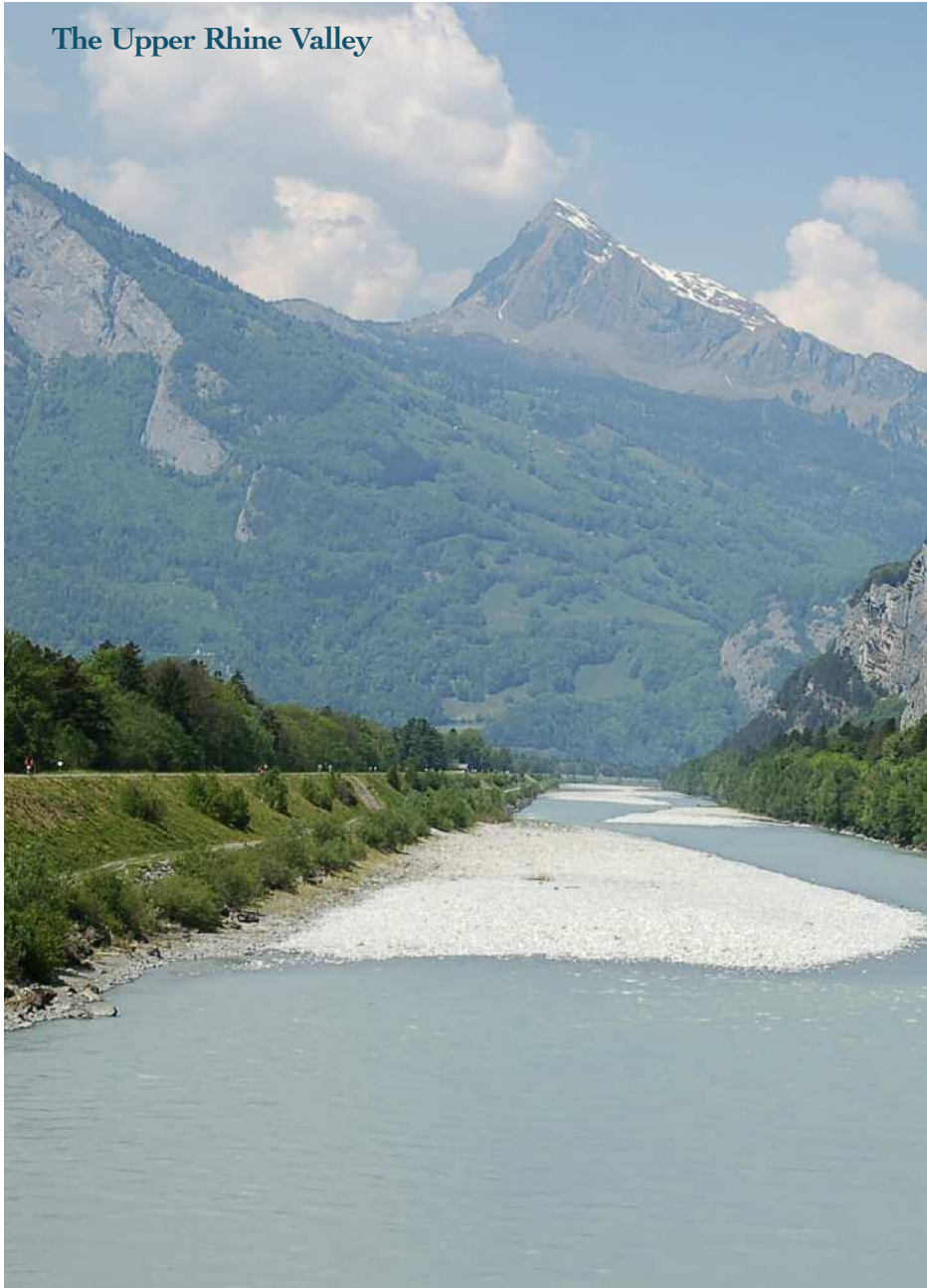
The Upper Rhine Valley