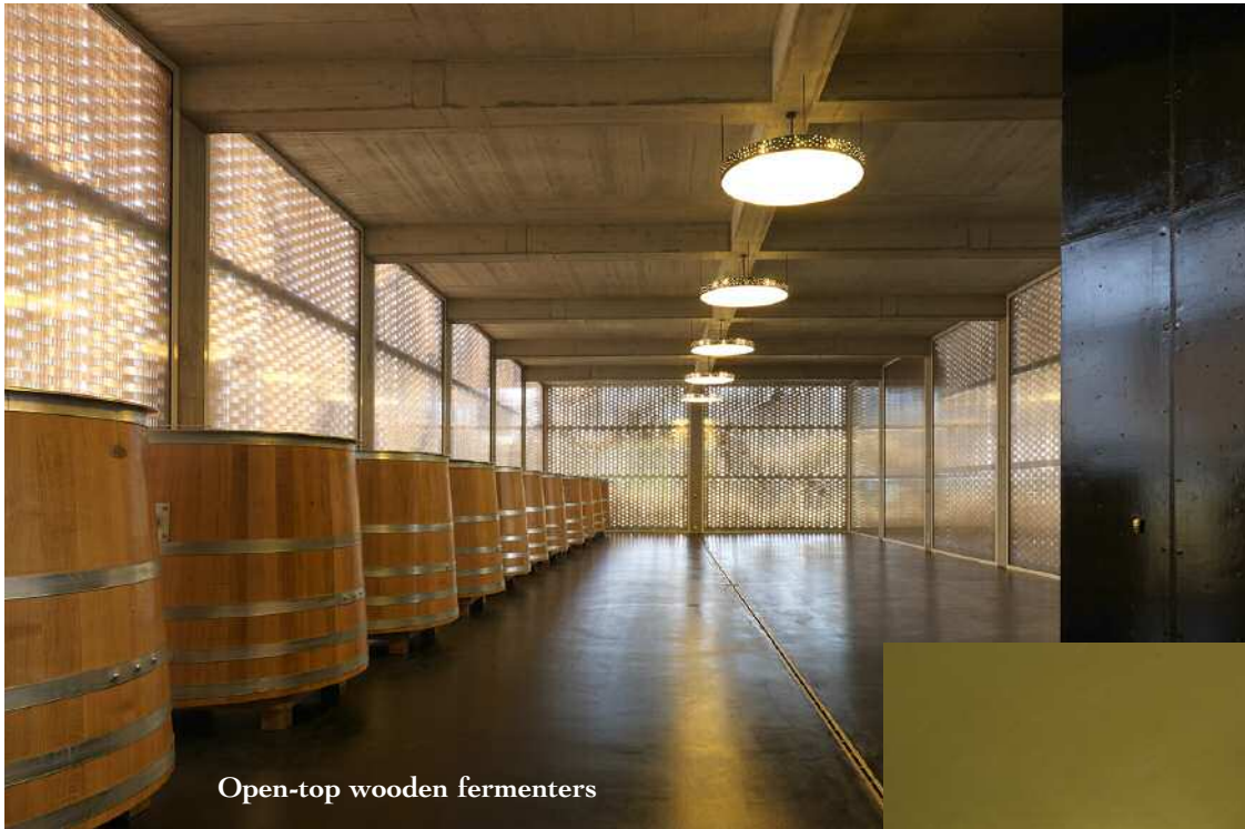
Open-top wooden fermenters