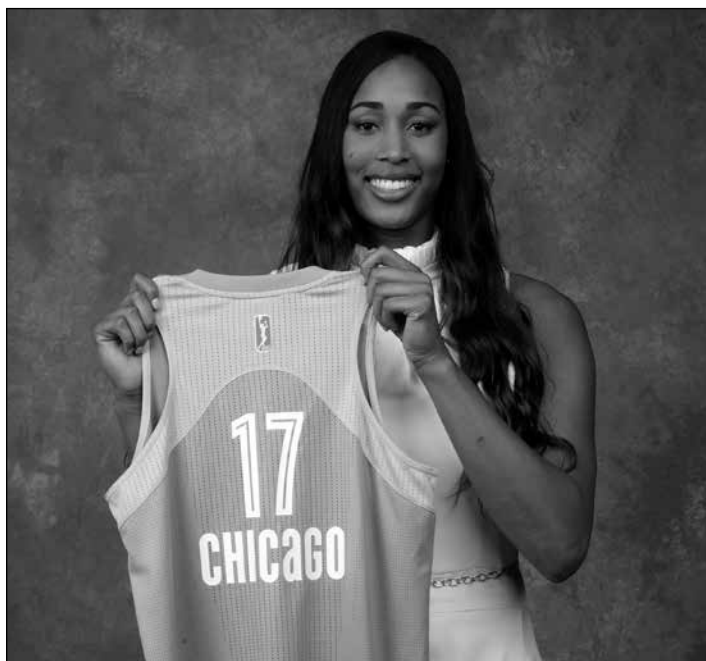
Alaina Coates was the No. 2 overall pick in the 2017 WNBA Draft.