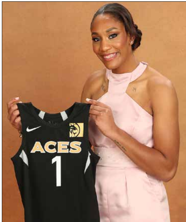
A'ja Wilson was the No. 1 overall pick in the 2018 WNBA Draft, going to the Las Vegas Aces. She is just the third Gamecock of any sport to be the No. 1 overall pick in a professional draft.