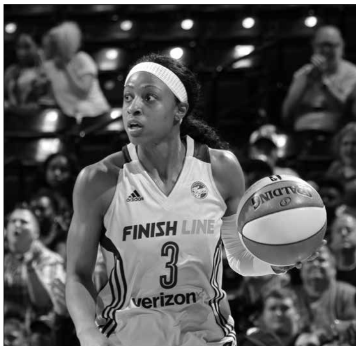
A finalist for at least one national player of the year award each of her last three seasons at South Carolina, Tiffany Mitchell (2013-16) was the ninth pick in the 2016 WNBA Draft and went on to earn WNBA All-Rookie honors in her inaugural season.

2012 SEC Brad Davis Community Service Postgraduate Scholarship (finalist); SEC Community Service Team