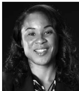
Dawn Staley (2009-present) 250-87 (.742)