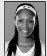
A'ja Wilson (2015, 2016, 2017, 2018)