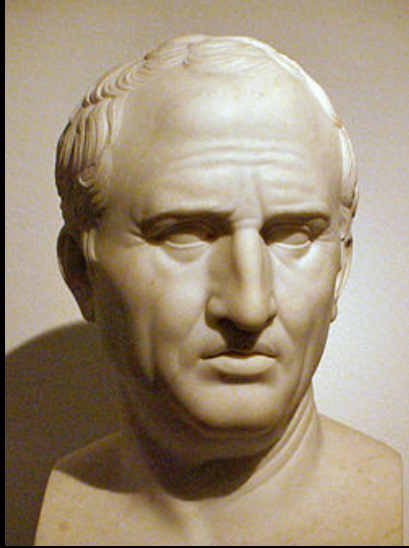
Marcus Tullius Cicero

Cicero viewed crucifixion as “the penalty for slaves” and “a most cruel and most terrible punishment.”