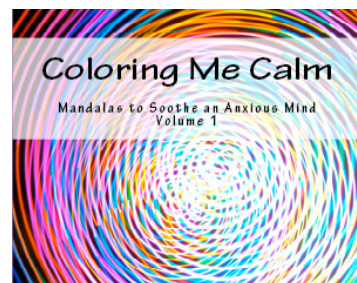
Coloring Me Calm Adult Coloring Book

Affiliate Disclaimer: In the spirit of full disclosure some of the links in this report may be affiliate links, which means I may receive compensation from some of the entities listed here for referrals, as their “thank you” for sending you their way. However, we never recommend any service or product solely for the reason of receiving commissions and I don’t recommend a product or service that I have not reviewed and or used myself.