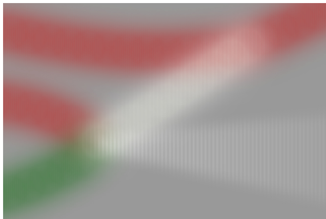
FIGURE 3. Integral interactions of wavefunctions.

We expect a world made of waves to look “ghostly”. But the Principle of Integral Interactions imposes well-defined “nodes” in the evolution of the waves. These nodes are very distinct, significantly constraining and structuring the wave fields. An atom is stable because the equation governing it has stable solutions, but this doesn't prevent the atom's wavefunction being spread or split. Integral interactions provide interconnectivity of the waves in more structured matter. A four-dimensional view is that the objects are networks of waves, linked by integral interactions. Like Feynman graphs, but with edges being all kind of possible single particle states (which are waves), and the vertices governed by the Principle of Integral Interactions.