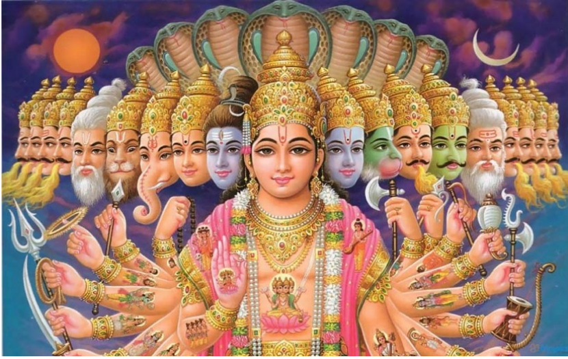
God Vishnu – keeper of life Illustrates the circulation of life, in his reincarnations during day and night, symbols of which are the Sun and Moon