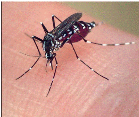
The Asian tiger's preferred breeding site is in an artificial container that can hold water for 7 days or more. These can be as large as an abandoned swimming pool, or as small as a bottle cap.

Take the time to make regular inspections around your home and eliminate breeding spots, and protect yourself and your family when you're outdoors.