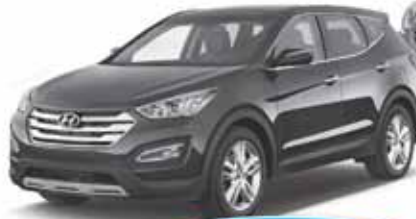
Hyundai Santa Fe