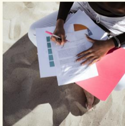
Staff + leader resources →