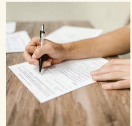
Background check information →