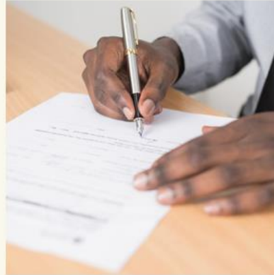
Volunteer Form Templates →

Dynamic hub for CYPM, training, and resources