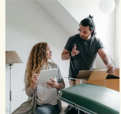
Additional training materials →