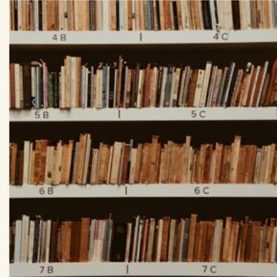
Supplemental resources →