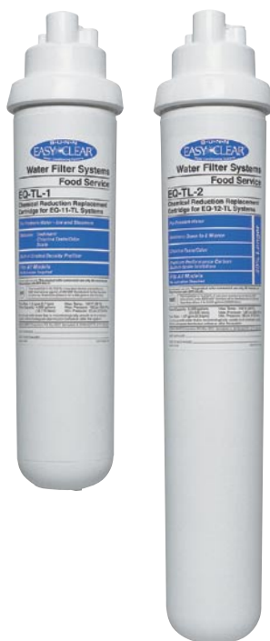
Model EQ-11-TL & EQ-12-TL Water Quality Systems