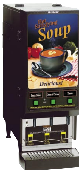
FMD-3 front display panel