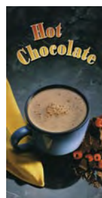
Model FMD-1 available with optional Hot Chocolate Display