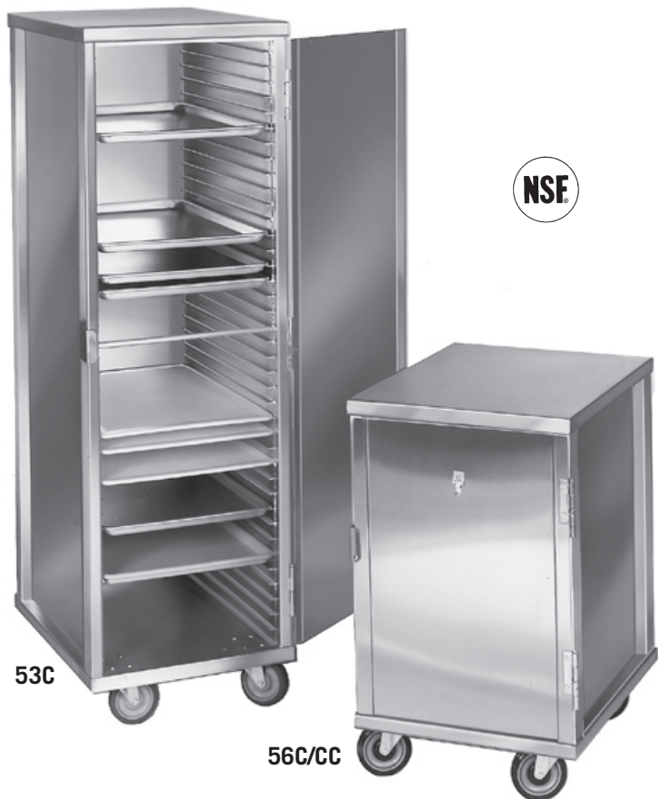
FL - Front Load