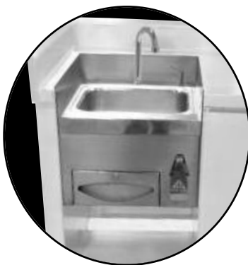
7-PS-43 Shown Above Installed in a Work Table