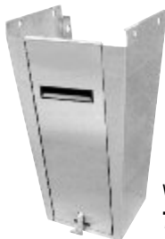
With Foot Valve 7-PS-33