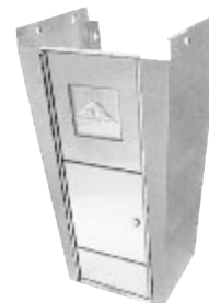
Add Trash Receptacle To 7-PS-33 or 7-PS-37 7-PS-29

ADVANCE TABCO is constantly engaged in a program of improving our products. Therefore, we reserve the right to change specifications without prior notice.