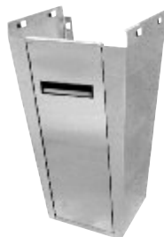
Pedestal Base Only 7-PS-37