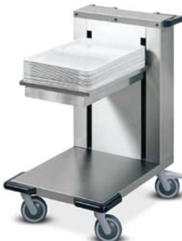
Item Number: DXMOCTD